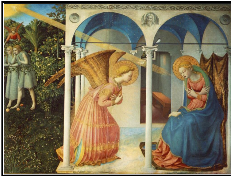
THE ANNUNCIATION Fra Angelico, 1439